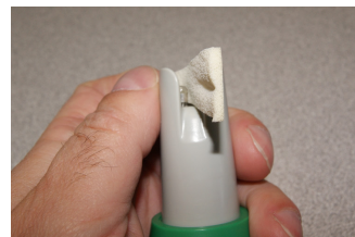
Wipe back and forth with the foam